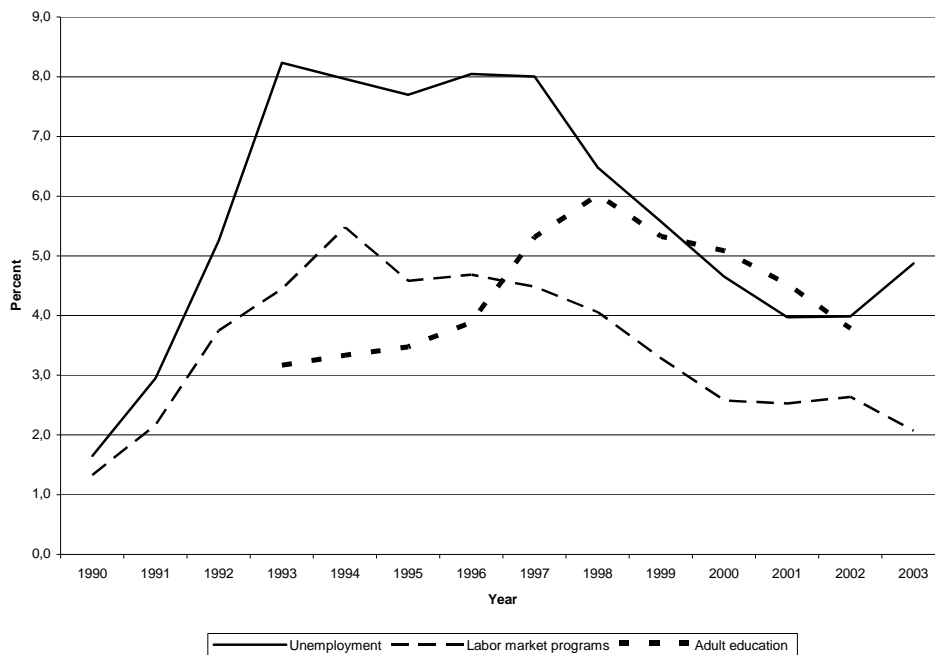
Fig 1; Unemployment, labour market programs and adult education in Sweden 1990 – 2003 (in percent of total labour force).

Note: 'Adult education' denotes the number of individuals enrolled in at least one course. This includes a large fraction attending only short courses. Unemployment and labour market programs are measured as yearly averages.